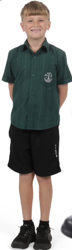
Examples of suitable shoes