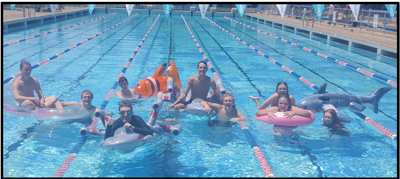
Year 12 students after their final race